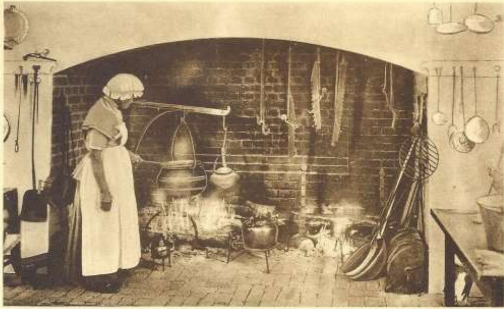
Governor's Palace Kitchen Williamsburg, Virginia