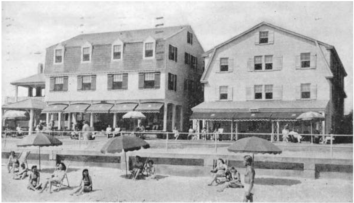
MURRAY'S--The Inn on the Ocean, at Virginia Beach, Virginia