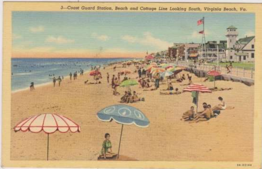
3-Coast Guard Station, Beach and Cottage Line Looking South, Virginia Beach, Va.